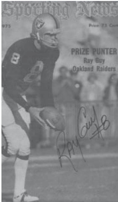
PRIZE PUNTER Ray Guy Oakland Raiders